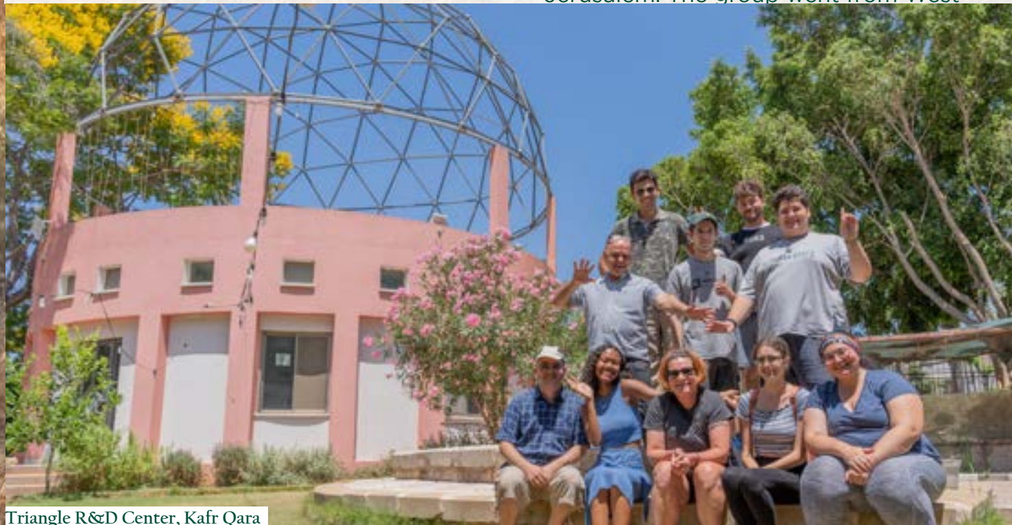
Triangle R&D Center, Kafr Qara

"The study abroad program was thought-provoking, a close look at what Israeli life is like on the ground."