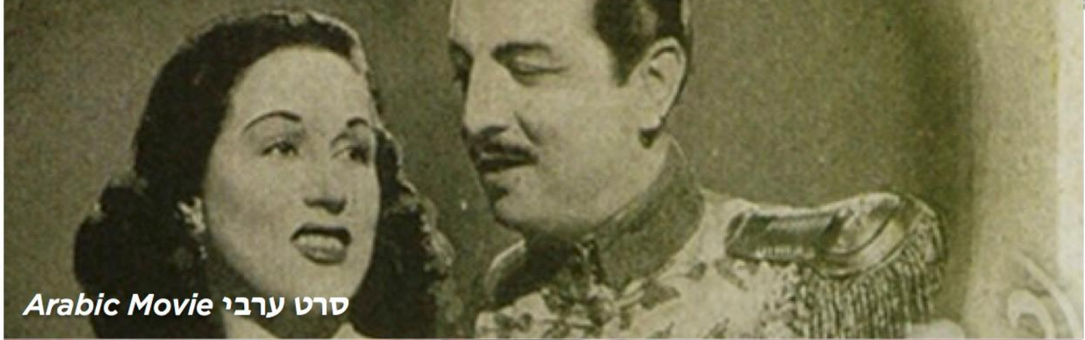
Arabic Movie סרט ערבי