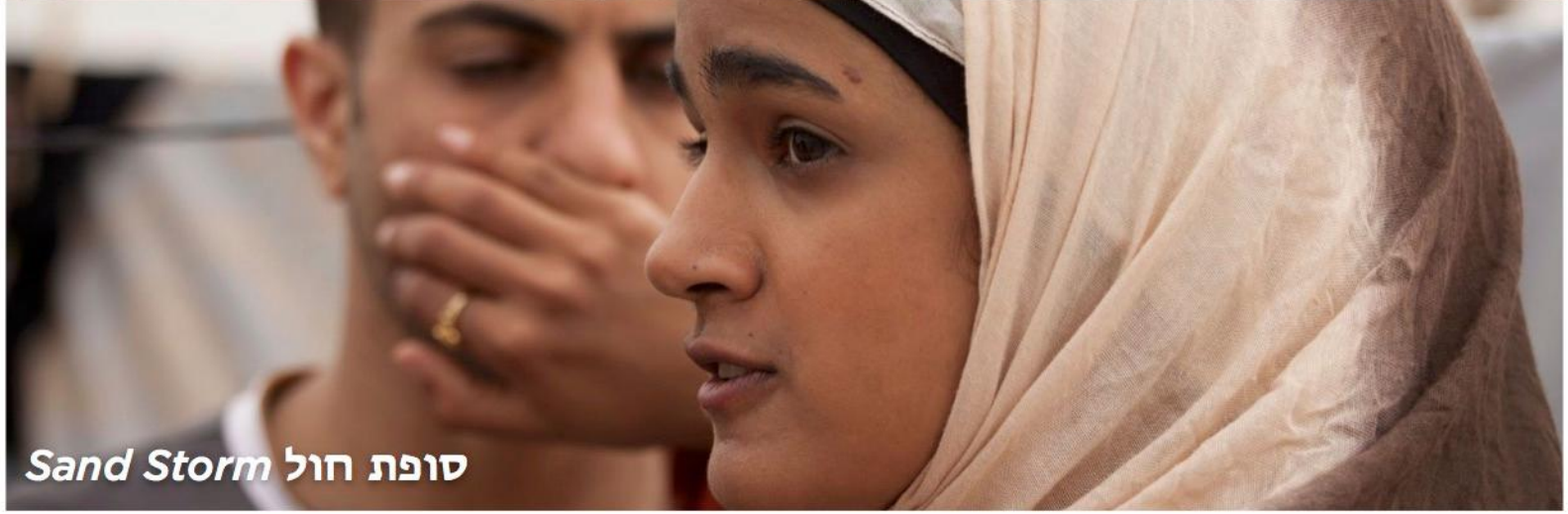
Sand Storm סופת חול