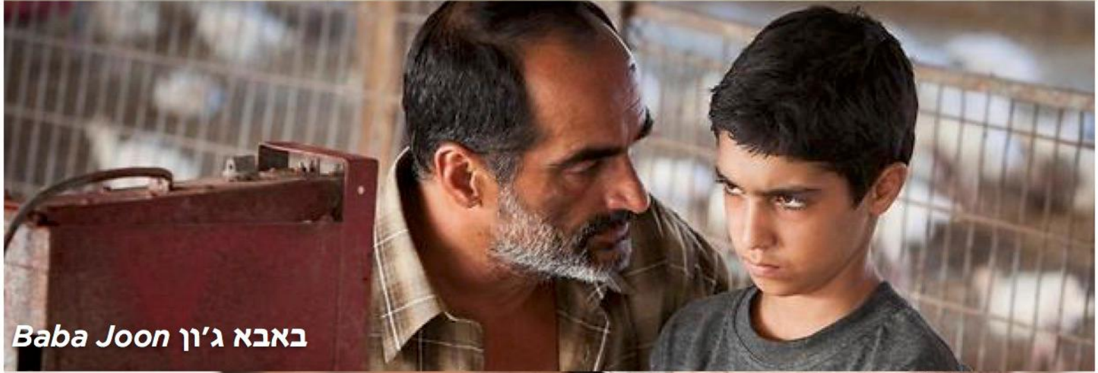
Baba Joon באבא ג'ון