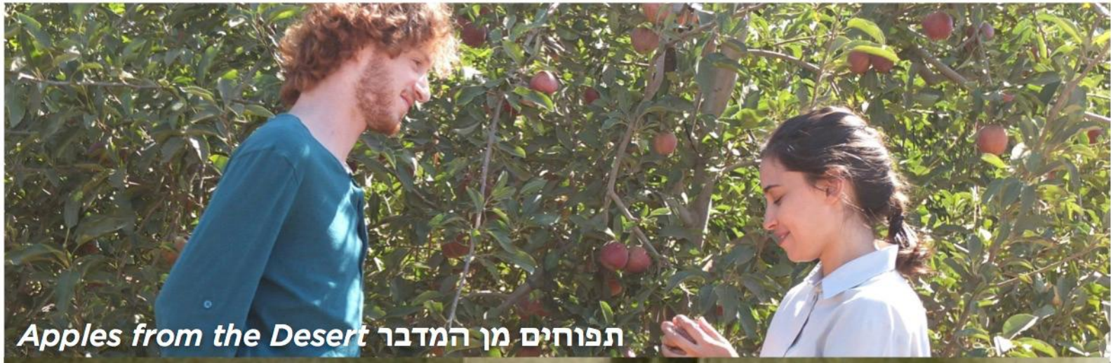
Apples from the Desert תפוחים מן המדבר