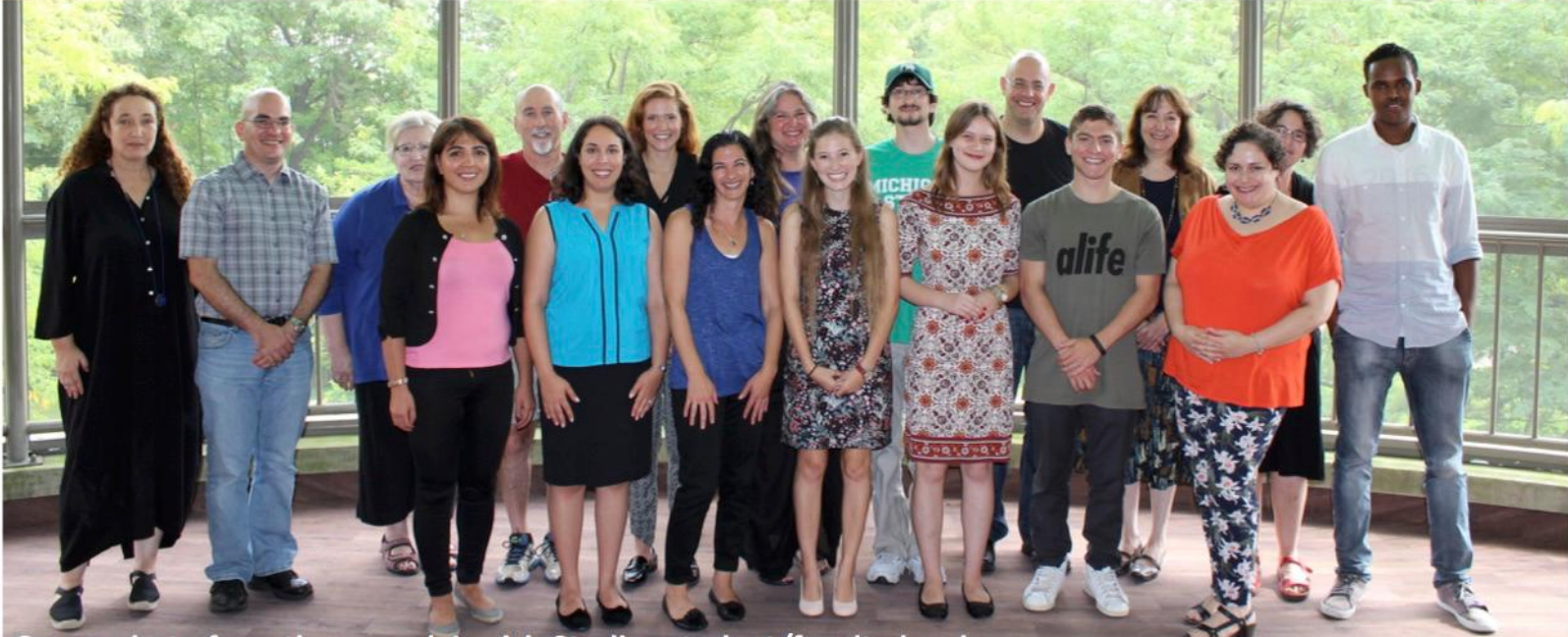
Group photo from the annual Jewish Studies student/faculty lunch